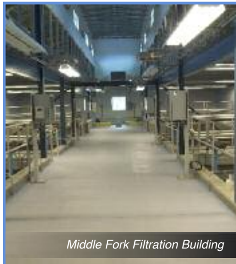
Middle Fork Filtration Building

Typically, there are three water treatment processes in our industry, and WCSA employs all three. First, if there is a groundwater source that is not under