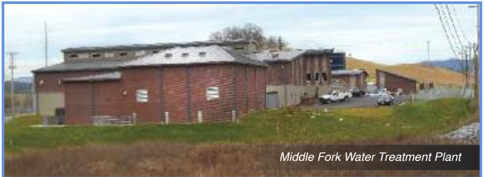
Middle Fork Water Treatment Plant

In the Fall/Winter 2013 issue of In the Pipe , we concluded a three-part series about who the Washington County Service Authority (WCSA) serves, how we serve, and some of what is involved in providing these services. To view the series, please visit our website at www.wcsawater.com . In this issue, we are introducing the first of a three-part series about our water and wastewater treatment processes.