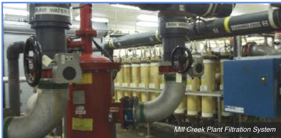
Mill Creek Plant Filtration System

pumped toward Glade Spring, the Town of Abingdon or the Bristol area. It is believed that this source was developed in the 1930s under the Works Progress/Projects Administration. For redundancy, this area, except for Taylor's Valley, can also be served by the Middle Fork Drinking Water Plant.